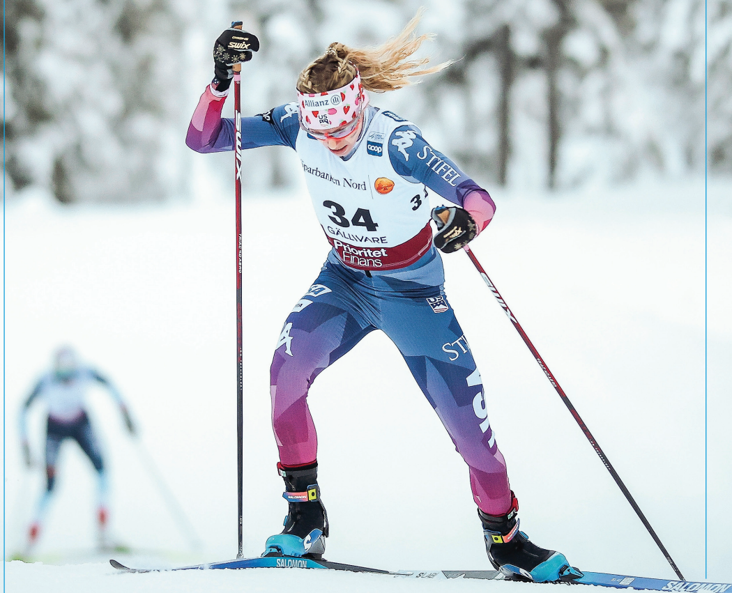
Jessie Diggins Stifel U.S. Ski Team

Stifel, Nicolaus & Company, Incorporated | Member SIPC & NYSE | www.stifel.com